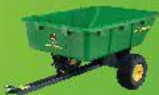
JOHN DEERE 10P POLY CART $579.95 INC GST