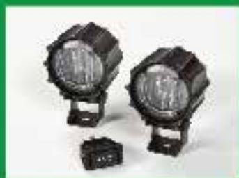
MID RANGE LIGHTS $235 INC GST