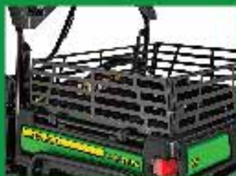
CARGO BOX WALL EXTENSIONS $675 INC GST