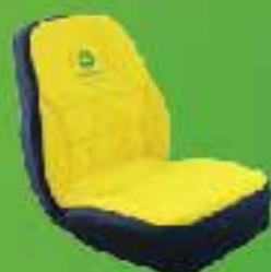
LAWNMOWER SEAT COVERS FROM $49.95 INC GST