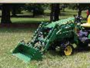
LOADER WITH 4-IN-1 BUCKET $5,800 INC GST