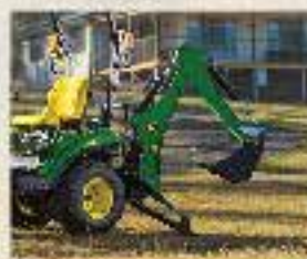
JOHN DEERE 260B BACKHOE $8,500 INC GST