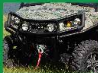
FRONT BRUSH GUARD $420 INC GST