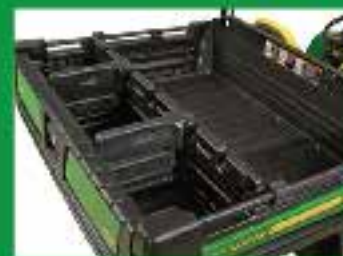
CARGO BOX DIVIDERS $395 INC GST