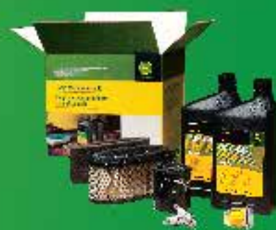
LAWNMOWER HOME MAINTENANCE KITS FROM $45.00 INC GST