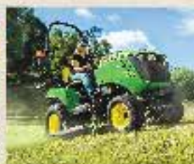
54" MOWER DECK $3,150 INC GST