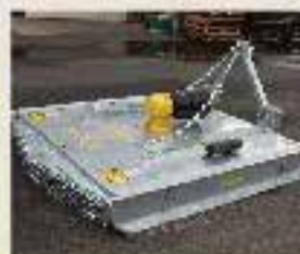
FIELDQUIP 1200MM SLASHER $2,195 INC GST