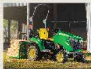
FIELDQUIP 1200MM CARRY ALL $715 INC GST