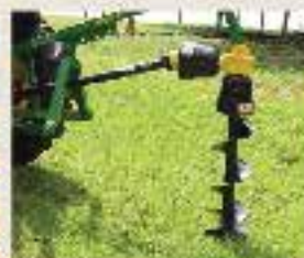
FIELDQUIP POST HOLE DIGGER $2,305 INC GST