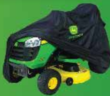
LAWNMOWER COVER $119.95 INC GST